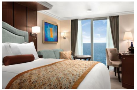
Deluxe Ocean View Approx. 242 ft<sup>2</sup> from $4,198

Oceania Cruises' beautiful 1,250 passenger Riviera will be your home. As we indulge in European culture, we will experience wine tastings, wine parties, and exclusive wine dinners. Learn about this renowned Washington State winery, as we share great wines, stories, and experience the grandeur of Europe.