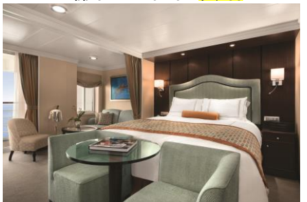
Penthouse Suite Approx. 420 ft<sup>2</sup> (incl balcony) from $6,098